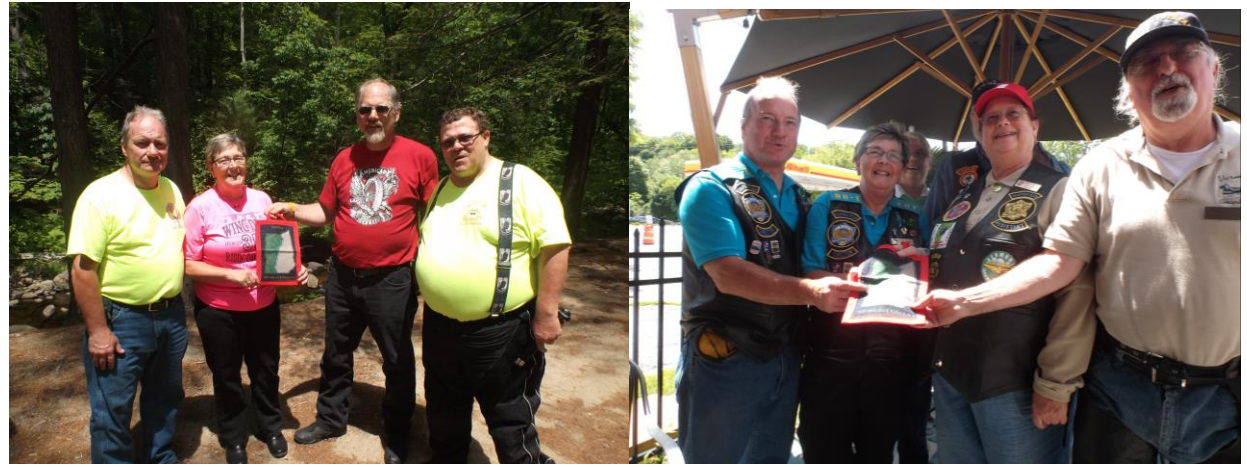
NH-E capturing Flag from NH-A