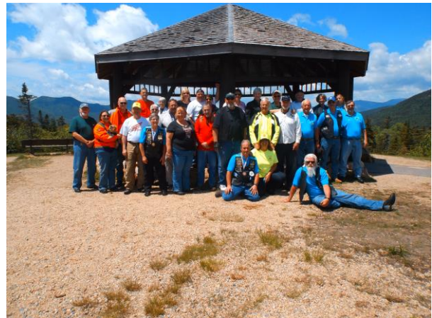
NH-E, NH-A, NH-G, Ca 1-L