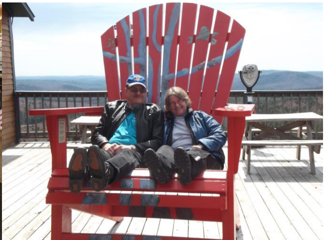
WHO'S BEEN SITTING IN MY CHAIR?