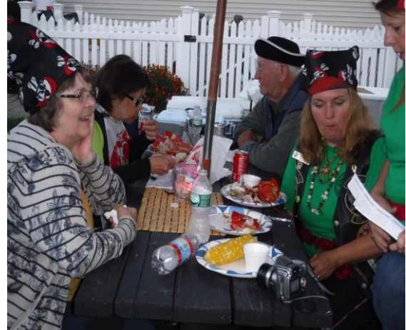
VT-A Beach weekend