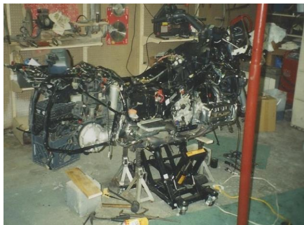
NH-E Trivia, What two owners in Chapter E owned this bike, what color was it?