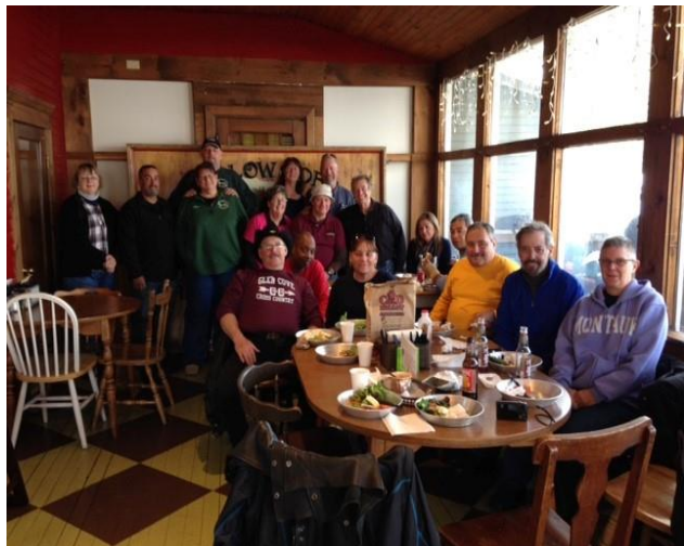
NY-K, NH-G, NH-E at Cider Mill